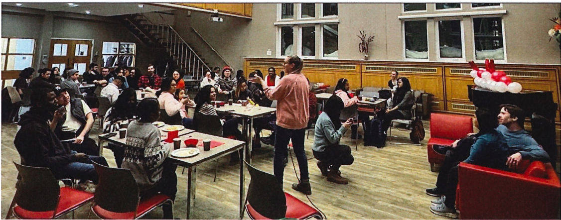
Valentine's Day meal. Fun, and talk about real love.