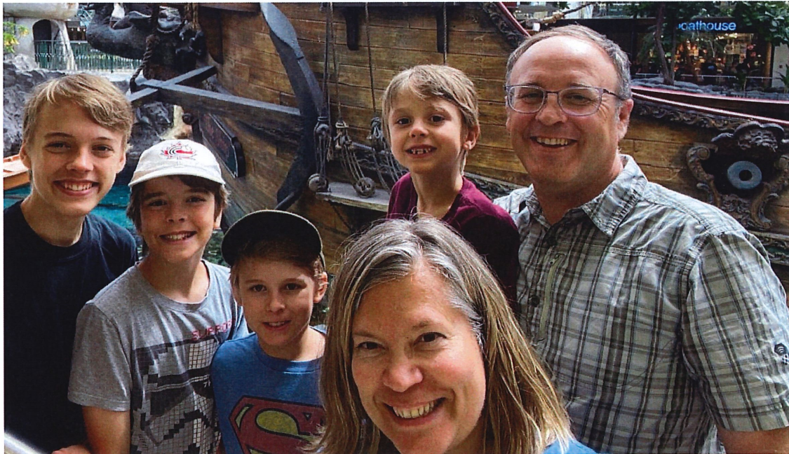
Remembering last summer in Edmonton as we look forward to warmer weather soon!