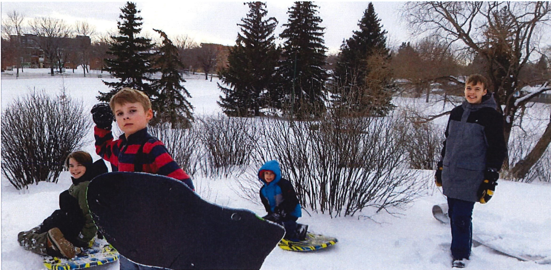
Boys enjoying sledding